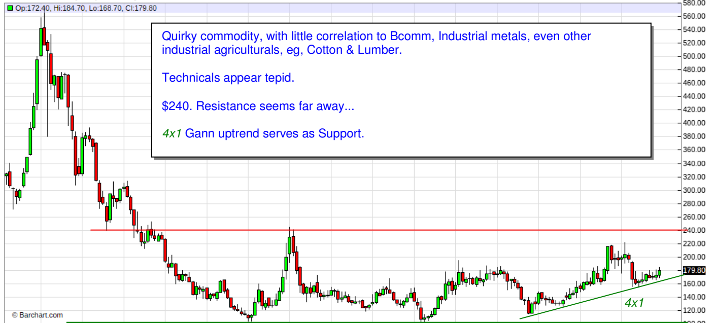
W2 - SGX TSR20 (FOB) - Monthly Nearest Candlestick Chart