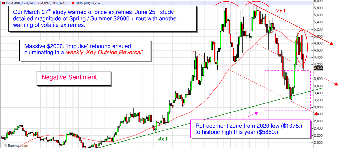
RM - Robusta Coffee 10-T - Weekly Nearest Candlestick Chart

Open Interest: (last 2 years): Prices rising, OI declining: Textbook: 'Current uptrend weakening'.