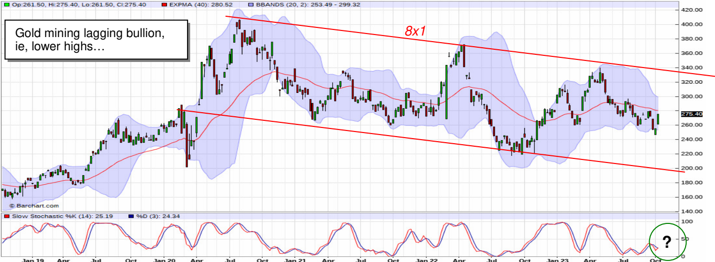
AY - TSX Global Gold - Weekly Nearest Candlestick Chart