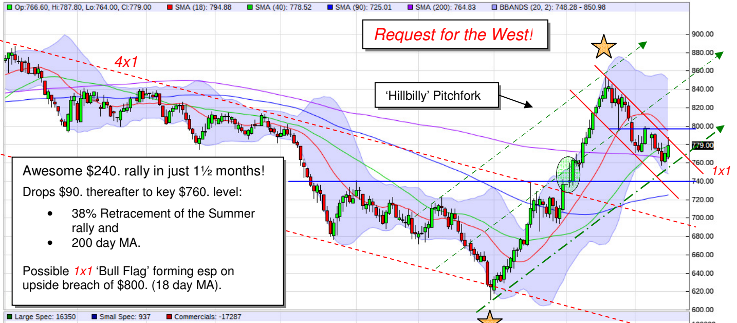
RSX23 - Canola - Daily Candlestick Chart