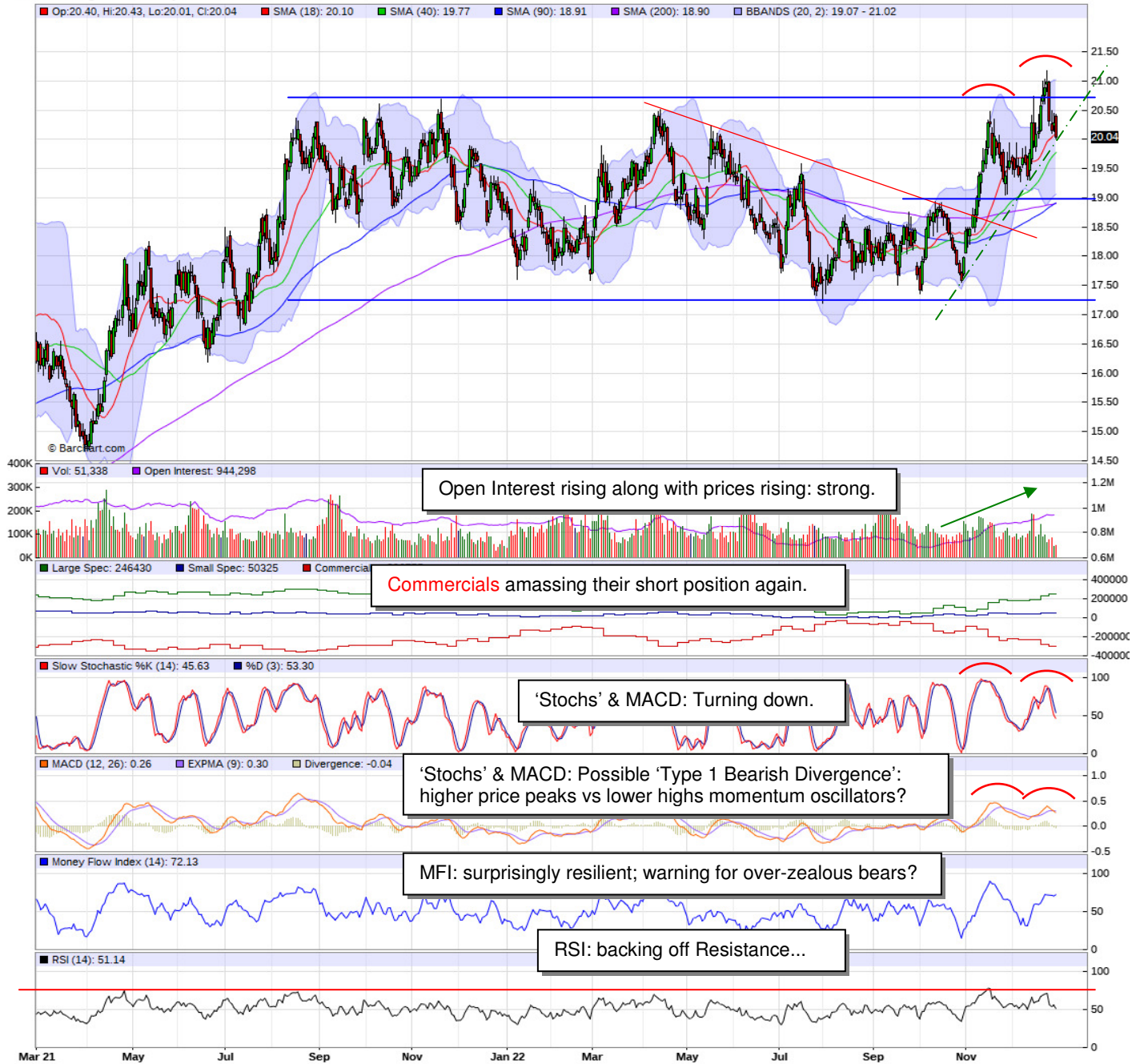
SBH23 - Sugar #11 - Daily Nearest Candlestick Chart

Open Interest rising along with prices rising: strong.