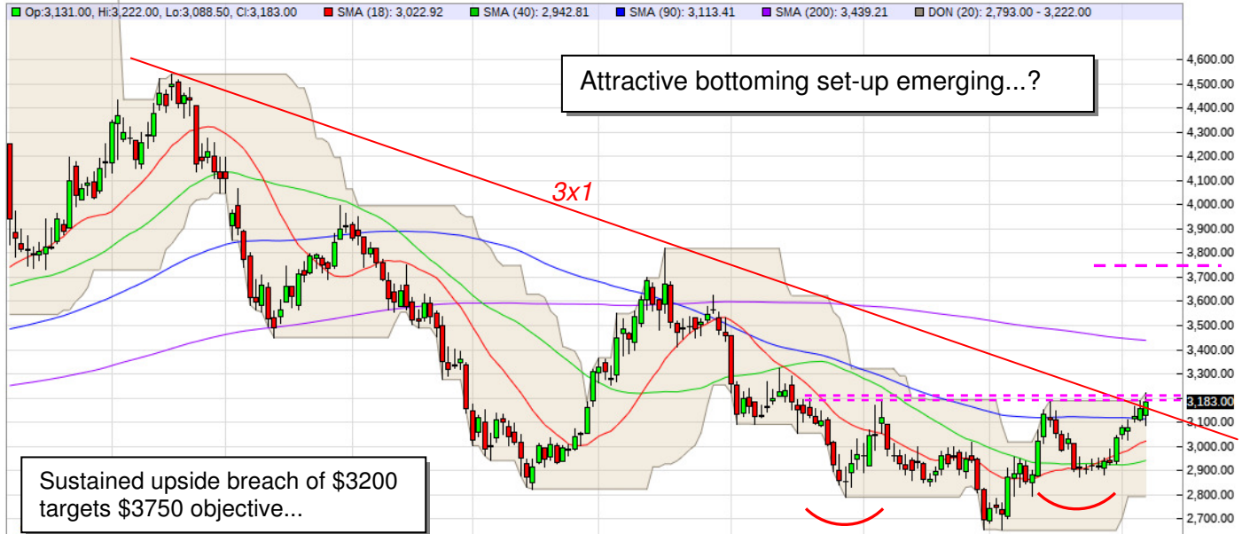
Q4Y00 - Zinc Special Hg 3M - Daily Candlestick Chart