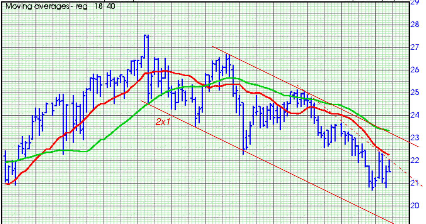
SUGAR #11 OCT 2011 ... daily Stochastic - %k and %d 14 3