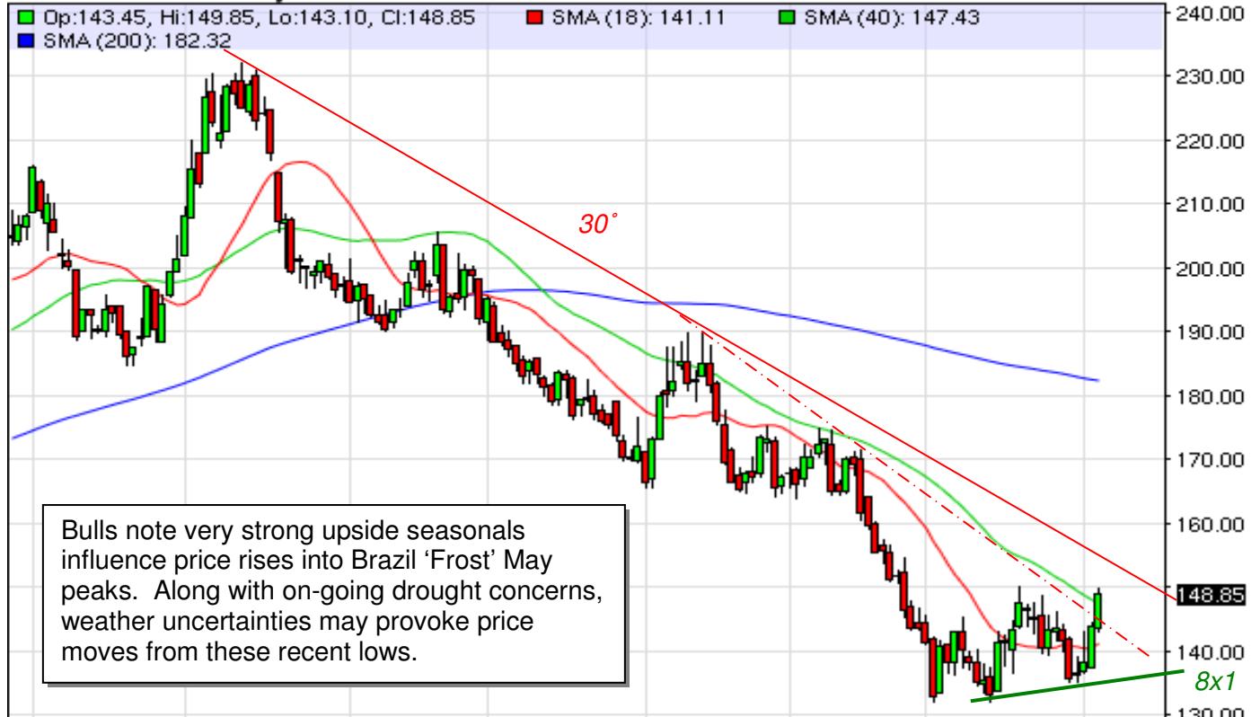
KCN15 - Coffee - Daily Candlestick Chart