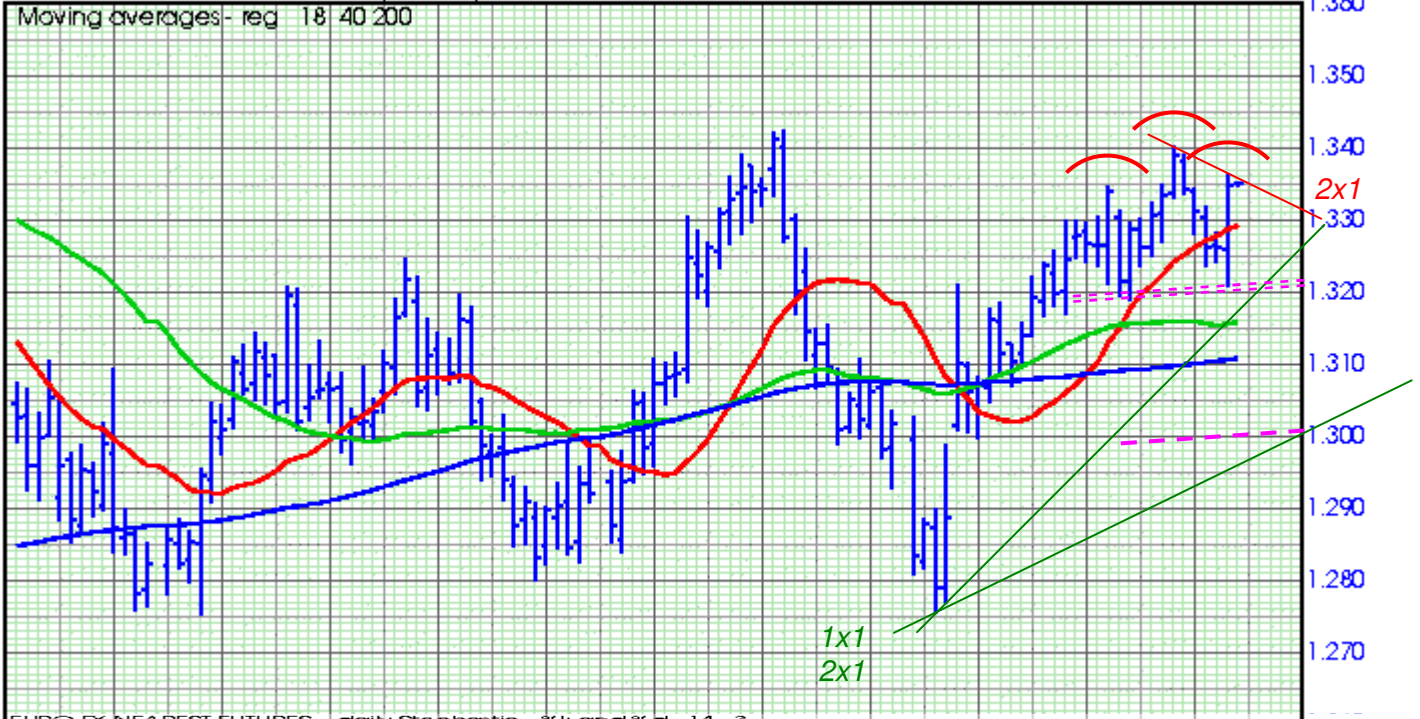
EURO FX NEAREST FUTURES .. daily Stochastic - %k and %d 14 3