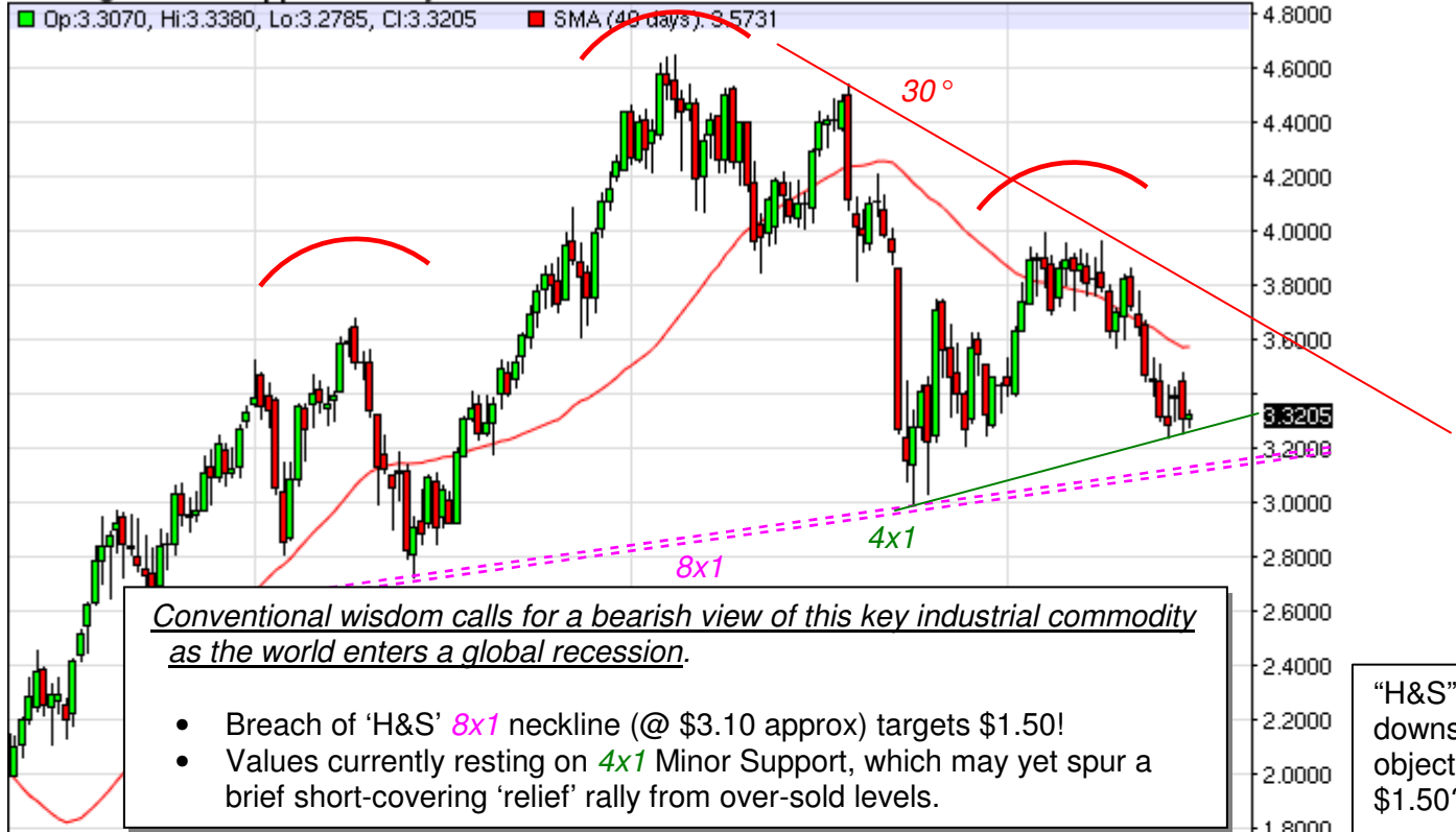
HG - High Grade Copper - Weekly Candlestick Chart